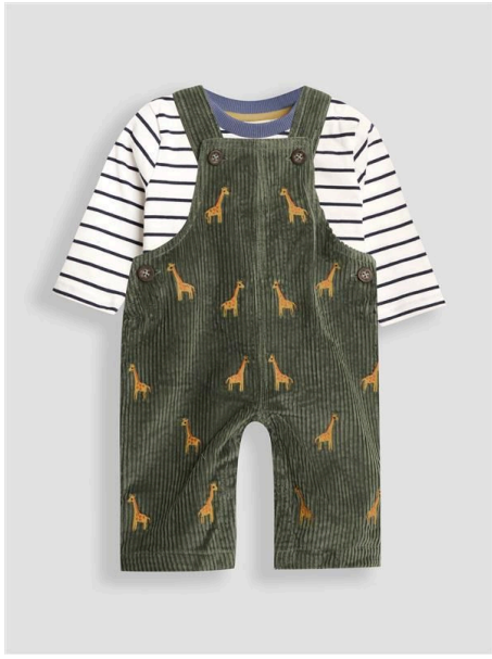
2-Piece Embroidered Cord Dungarees & Top Set