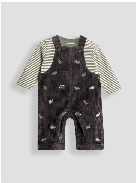
2-Piece Embroidered Cord Dungarees & Top Set