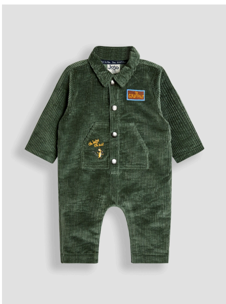
Gruffalo Cord Romper