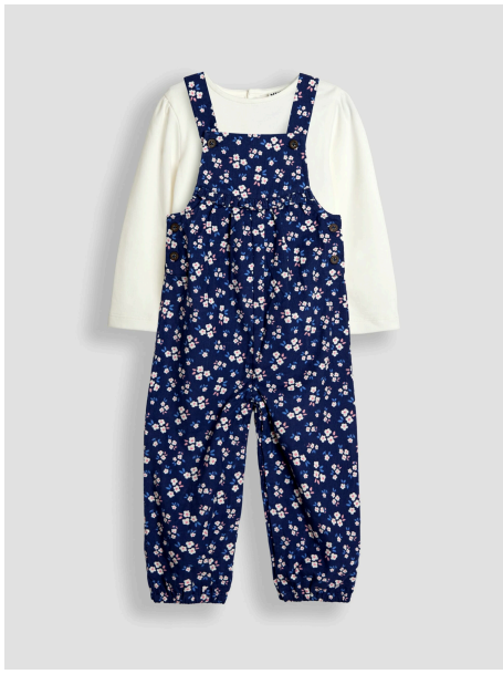
Floral Cord Dungarees And Top Set