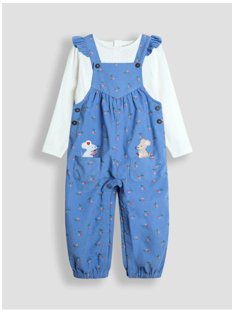
Cherry Printed Cord Dungarees & Top Set