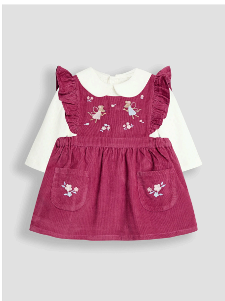
Fairy Mouse Cord Dress with Body