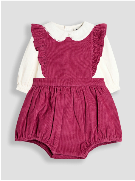
Cord Bubble Romper and Body Set