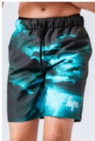
PRODUCT NO. NXTQ32B316 HYPE TURQUOISE CLOUD KIDS SWIM SHORTS