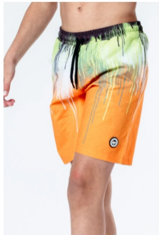
PRODUCT NO. YWF-315 HYPE SLIME DRIPS KIDS SWIM SHORTS