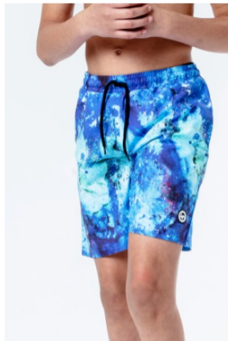
PRODUCT NO. YWF-329 HYPE SEA SPRAY KIDS SWIM SHORTS