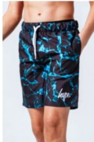
PRODUCT NO. NXTQ32B801 HYPE BLACK BLUE MARBLE KIDS SWIM SHORTS