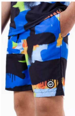
PRODUCT NO. VWF-360 HYPE COLOUR PAINT KIDS SWIM SHORTS