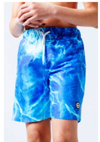
PRODUCT NO. VWF-355 HYPE SPACE POOL KIDS SWIM SHORTS