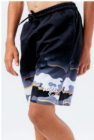
PRODUCT NO. NXT-Q3B09 HYPE CAMO FADE KIDS SWIM SHORTS

A safety issue has been identified with the following boys' swim shorts which were available online at Just Hype (the product number and product name are given in the photos below):