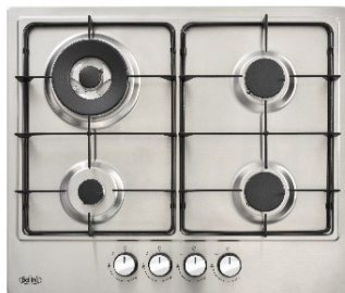
444410443 BEL GHU602C LPG Sta