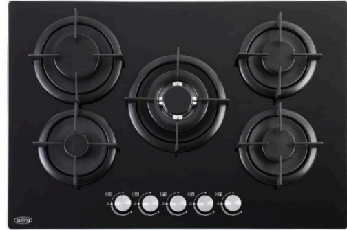
444411640 BEL GTG753RI BLK