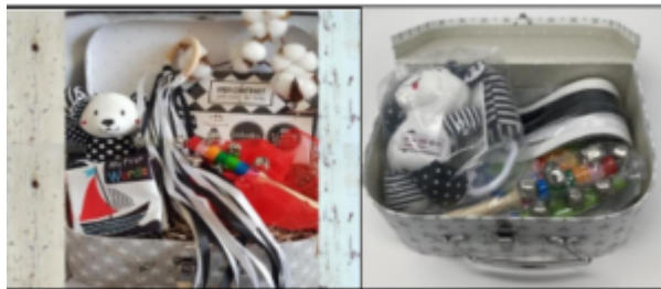
Fig. 2 Montessori Sensory Box