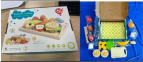
Fig. 1 Magnetic Breakfast Cooking Set

A safety issue has been identified with the following products sold on the Etsy platform: