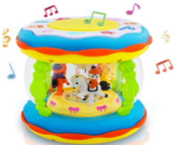
Fig. 1 Toddler and Baby Musical Learning Toy

A safety issue has been identified with the following products sold on the Wish platform: