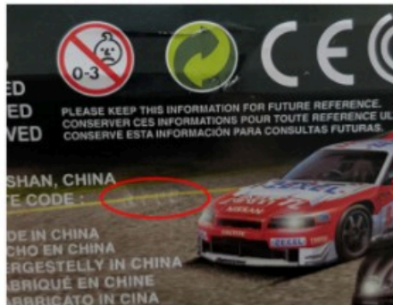
2. On the main packaging in embossed lettering near the barcode.

Image 2: Where to find the product batch number