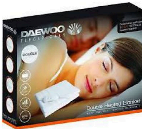
Double Sized Electric Blanket (HEA1179)