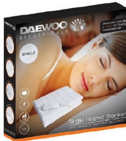
Single Sized Electric Blanket (HEA1178)